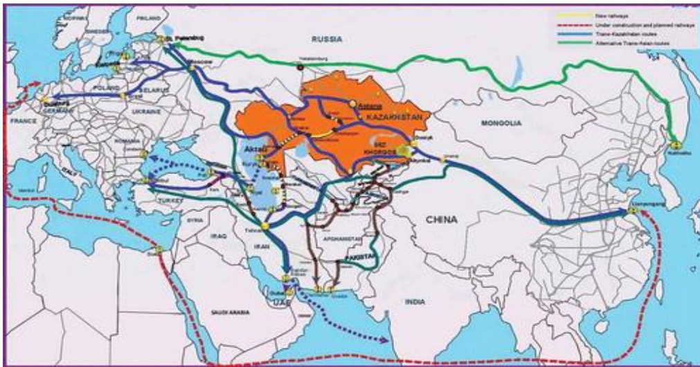
Figure 1. Railway System Transit Routes via Kazakhstan.