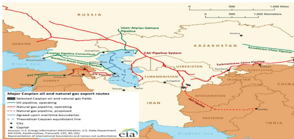
Figure 2: Silk Road: China's Trade Connections