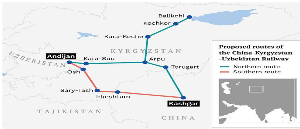
Figure 4: The China Railway system in Fergana Valley

China has a deep economic interest connected to the Fergana Valley. In this aspect, China is ready to facilitate the region with a high degree of connectivity by constructing a new railway link. This connection would further strengthen China's position and its economic ambitions. The Chinese government is providing mutual benefits to all three participants of Central Asian countries in this connection. China would be capable to connect its western Xinjiang region to the territory of Kyrgyzstan and then run through Uzbekistan's eastern town of Pap, which is basically Uzbekistan's section of the Ferghana Valley (Pannier, 2017).