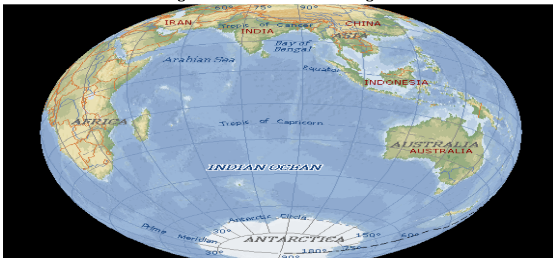
Figure 1: The Indian Ocean Region

vessels of the major powers like the US and other nuclear-weapon states such as Pakistan, China, and India. Besides, the US has established its military naval base in Diego Garcia on the isolated Island of Chagos archipelago in the Indian Ocean due to its interests in this region. Due to the strategic importance of the Indian Ocean and the competition among major regional powers, the US always supports India to counter Chinese hegemony in this region (Ahmed, 2015). The Indo-US partnership presumes to hedge against Chinese designs in the IOR. The threats to US hegemony from a rapidly expanding China are real and the National Security Strategy seems to have embarked upon a plan to counter this by deepening engagements with other increasing powers, pinpointing key allies. In a move, Trump could happily approve of gradually shifting the burdens of responsibility onto their shoulders.