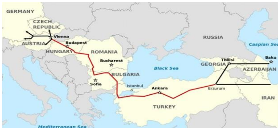
Figure 1: Map shows land and maritime route to Europe via South Caucasus