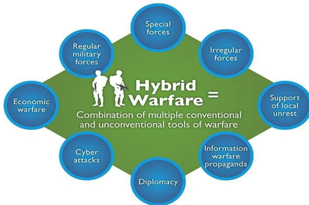
Figure 1 : Instruments of Hybrid Warfare (Sehgal,

From this analogy, it is evident that modern HW is about old approaches and practices suitably tailored to mesh with the development of technology and information tools which conveniently conceal the actual originator of the onslaught (Deep, 2015). In essence, therefore, there is nothing novel or innovative about HWs. In the past, no innovation is observed in so many conflicts globally with the exception that these are manifested either as grey zone hybrid or as open hybrid threats (Chambers, 2016, p.14). It is another matter, however, that the earlier types remain more elusive and challenging to recognize as compared to the latter one.