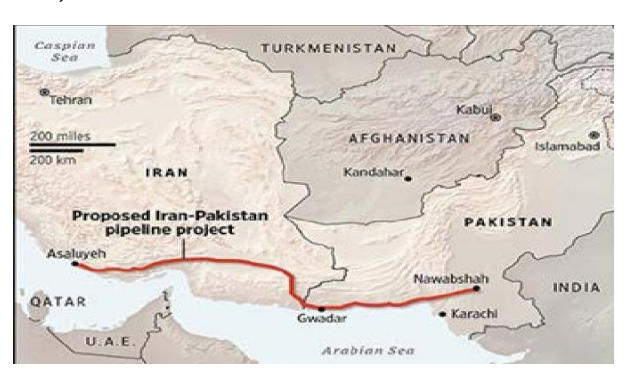
Figure 1: Proposed Iran-Pakistan Gas Pipeline

reservoirs in an effective and efficient way due to numerous factors including: the lack of updated technology to explore their resources, geopolitical issues especially with the U.S., lack of proper leadership policies, increasing energy costs, the strategic use of the Liquid Natural Gas (LNG), and international sanctions. The last factor prevents Iran from trading gas with its energy-hungry neighbors like Pakistan, India, and China.