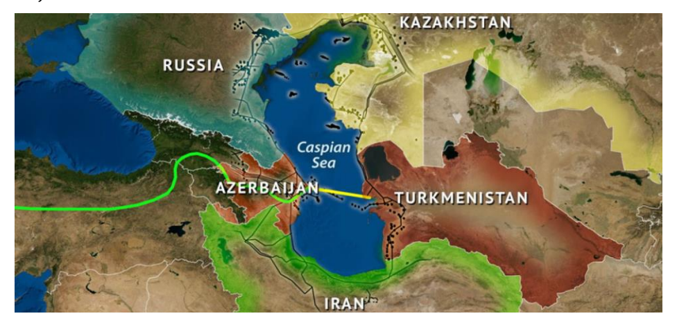
Figure number 2.

The Caspian's symbolic location importance stems from its availability of energy-rich resources. Huge amounts of hydrocarbon resources are found in the water, both in sea deposits and inland areas in the immediate area. It is believed that the Caspian has 480 million barrels of crude oil and 8.7 trillion cubic meters of gas in known or probable reserves (Chausovsky, 2014).