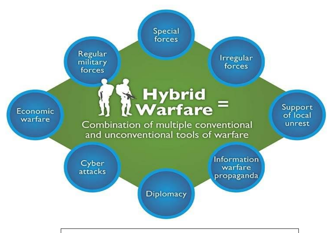
Figure 1: Instruments of Hybrid Warfare (Sehgal,

From this analogy, it is evident that modern HW is about old approaches and practices suitably tailored to mesh with the development of technology and information tools which conveniently conceal the actual originator of the onslaught (Deep, 2015). In essence, therefore, there is nothing novel or innovative about HWs. In the past, no innovation is observed in so many conflicts globally with the exception that these are manifested either as grey zone hybrid or as open hybrid threats (Chambers, 2016, p.14). It is another matter, however, that the earlier types remain more elusive and challenging to recognize as compared to the latter one.